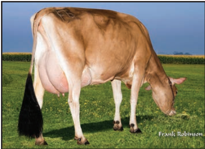
JX FARIA BROTHERS HARRIS JUVENTUS {5}-ET Grandam of Lot C choice

NEXT DAM: FARIA BROTHERS IMPULS GIGGS {4} 82% 2-07 297 2 17870 5.5 975 3.8 682 SIRE: ISDK Q IMPULS GJPI 72 30%ILE