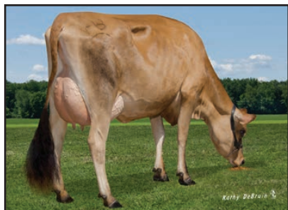
JX FARIA BROTHERS VANDRELL 308720 {3} Dam of Lot D Choice

BUYER SELECTS ONE DONOR DAM FROM LOTS B, C, D OR E TO IVF TO A MUTUALLY AGREEABLE SIRE. BUYER WILL RECEIVE A MINIMUM OF 10 IVF EMBRYOS FROM THE MATING. SALE TERMS: PAYMENT DUE AT THE TIME OF SALE. A. I. INTEREST EXPRESSED BY ABS, ALTA, CRV, GENEX AND SEMEX CALF WOULD RANK AMONG THE TOP JPI HEIFERS