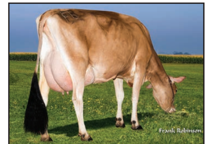
JX FARIA BROTHERS HARRIS JUVENTUS {5}-ET Grandam of Lot 35