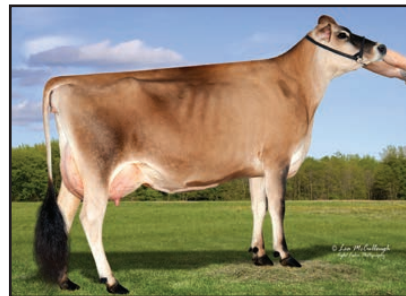
HILMAR MAGNUM 43054 Grandam of Lot E choice

NEXT DAM: HILMAR GREATNESS 20414 82% 3-08 303 3 25960 4.8 1259 3.6 944 SIRE: DEERVIM MOR GREATNESS-ET GJPI 2 12%ILE