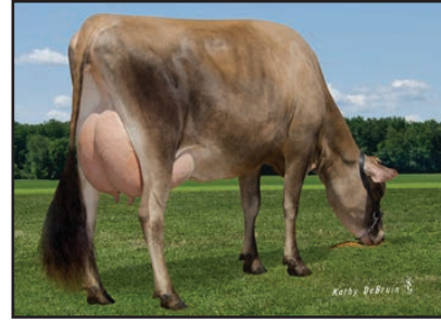
CINNAMON RIDGE METHOD BULGARIA Dam of Lot E Choice

HILMAR SPARKY 29906 84% USA 067329906 GT 6K BBR 100 JH1F JH2F DHIA HERD # 93-24-0072 CONTROL # 29906 1-09 301 2 20620 4.6 954 3.5 720 97DCR 2488C 2-09 305 3 26910 4.3 1163 3.5 948 95DCR 3174C 4-00 305 3 25870 4.5 1174 3.5 897 95DCR 3100C 305 2X ME AVG 3L 27030M 1195F 941P 3213C PPA 2260M 77F 70P / YD 1893M 65F 62P CDCB GPTA 06/05/2018 4RECS 84%R 88%ILE 808M 29F 29P 297CM$ 286NM$ 261FM$ 213GM$ 2.4PL -1.6DPR -1.8CCR 0.9HCR 2.89SCS AJCA 06/05/2018 GPTAT 81%R 1.2 GJUI 11.6 GJPI 77%R 85 SIRE: MAINSTREAM IATOLA SPARKY GJPI 93 48%ILE