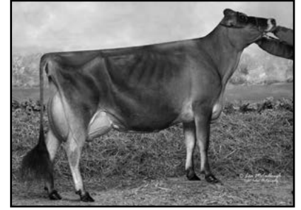
WF COMERICA GLENNA-P Sister to Lot 9