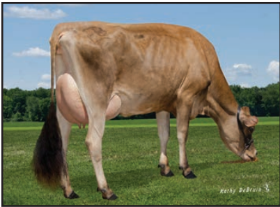
JX FARIA BROTHERS MARLO CHAPEL HILL {3}-ET Dam of Lot C choice

BUYER SELECTS ONE DONOR DAM FROM LOTS B, C, D OR E TO IVF TO A MUTUALLY AGREEABLE SIRE. BUYER WILL RECEIVE A MINIMUM OF 10 IVF EMBRYOS FROM THE MATING. SALE TERMS: PAYMENT DUE AT THE TIME OF SALE. A.I. INTEREST EXPRESSED BY ABS, ALTA, CRV, GENEX AND SEMEX CALF WOULD RANK AMONG THE TOP JPI HEIFERS