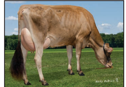
JX FARIA BROTHERS MARLO CHAPEL HILL {3}-ET Grandam of Lot 35

4TH DAM: FARIA BROTHERS IMPULS GIGGS {4} 82% 2-07 297 2 17870 5.5 975 3.8 682 102DCR 2360C